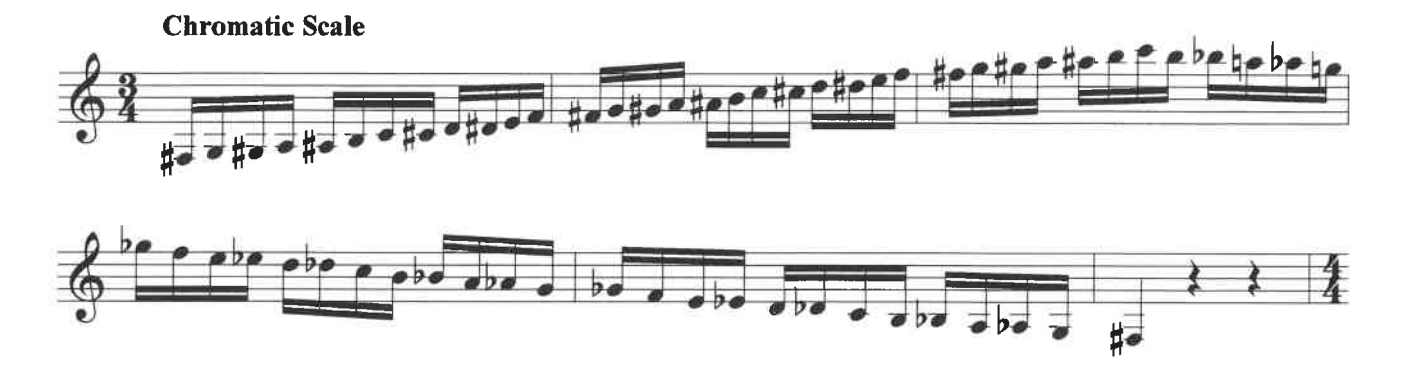
Missouri ASB Major Scales